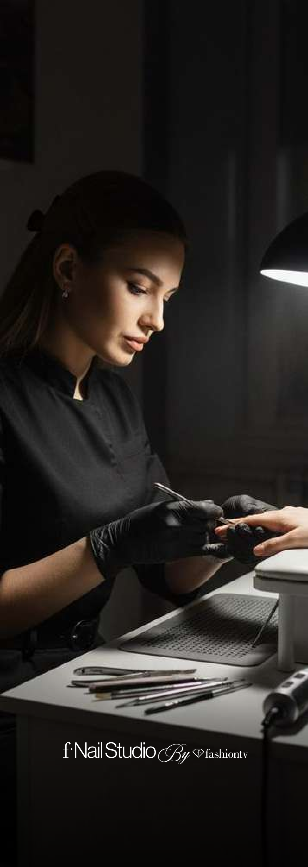
f:Nail Studio By fashiontv