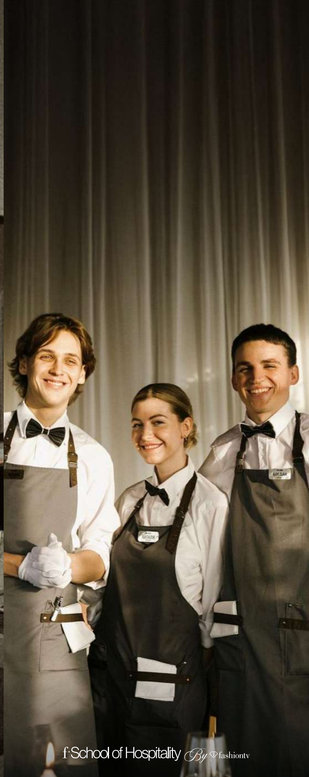
f School of Hospitality