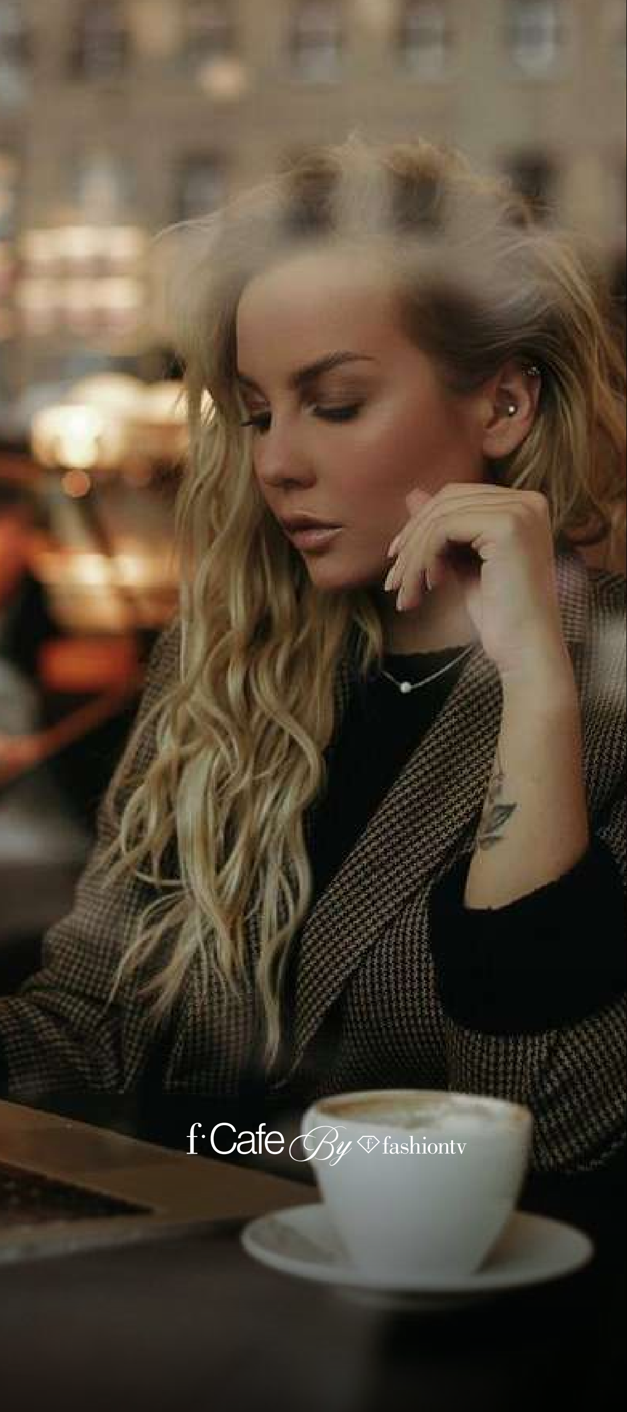
f:Cafe By fashiontv