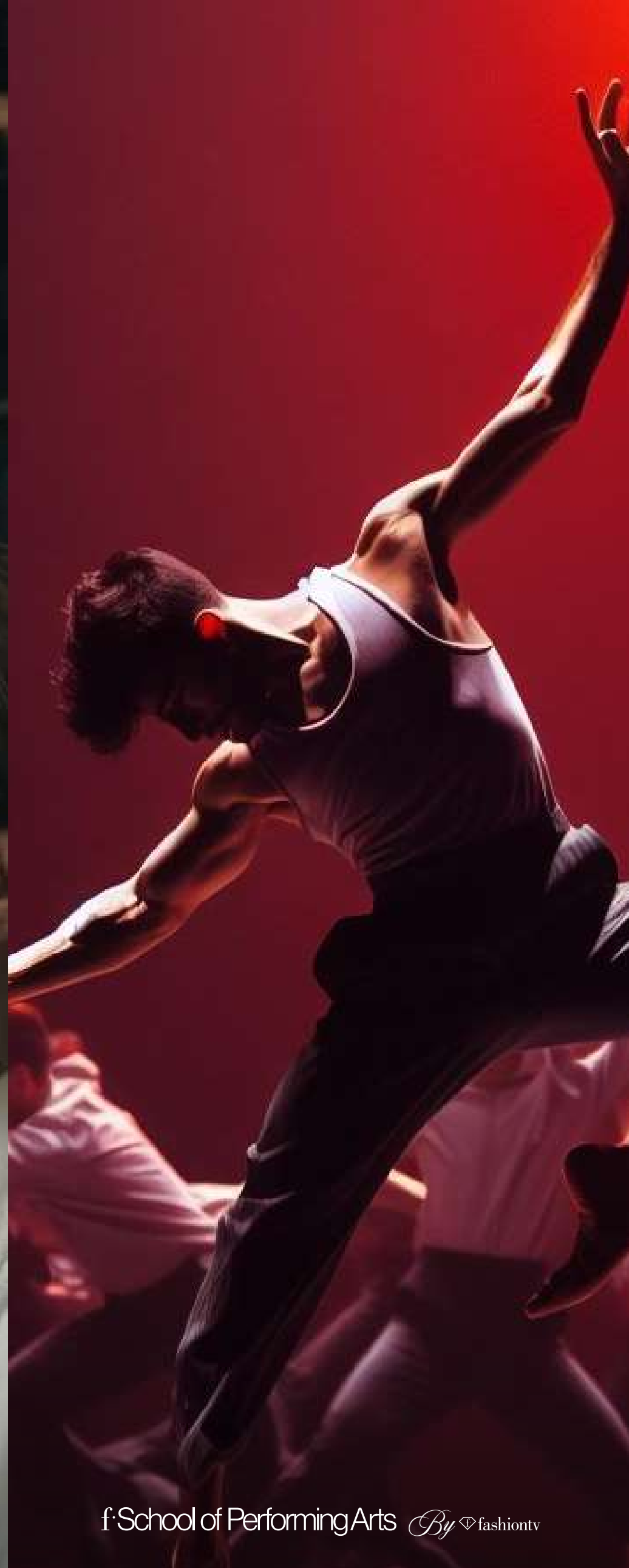
f School of Performing Arts By fashiontv