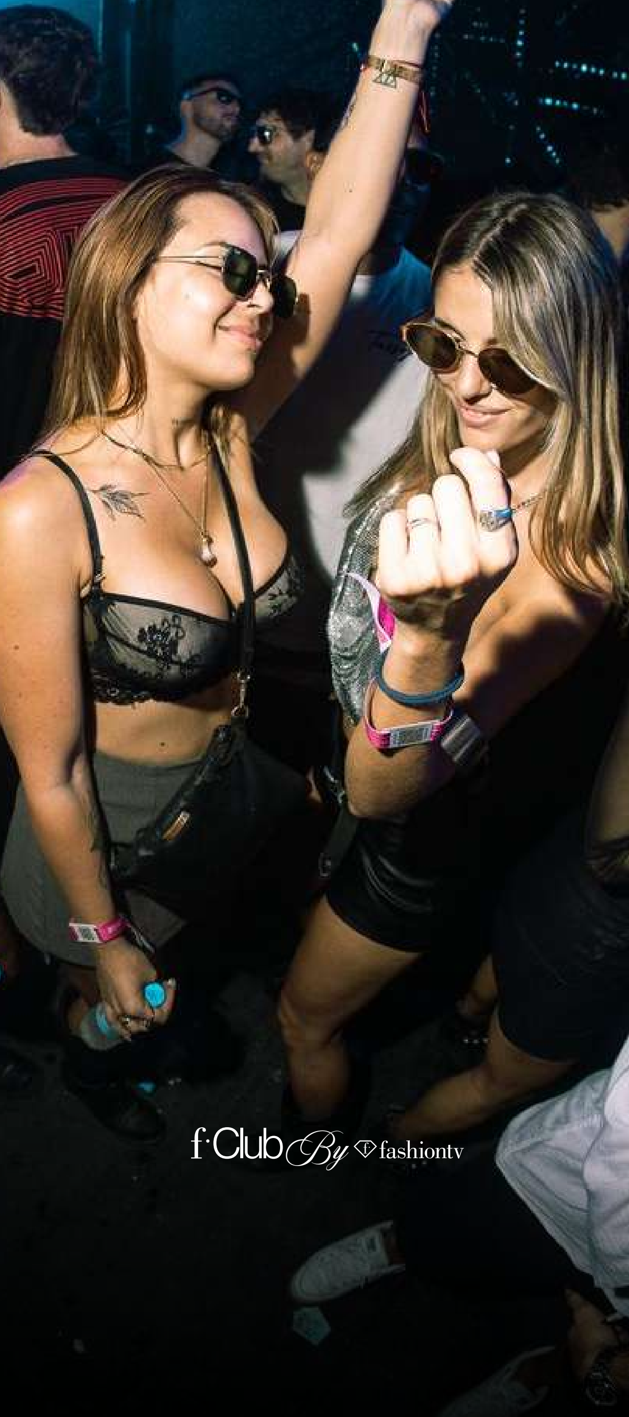
f:Club By fashiontv