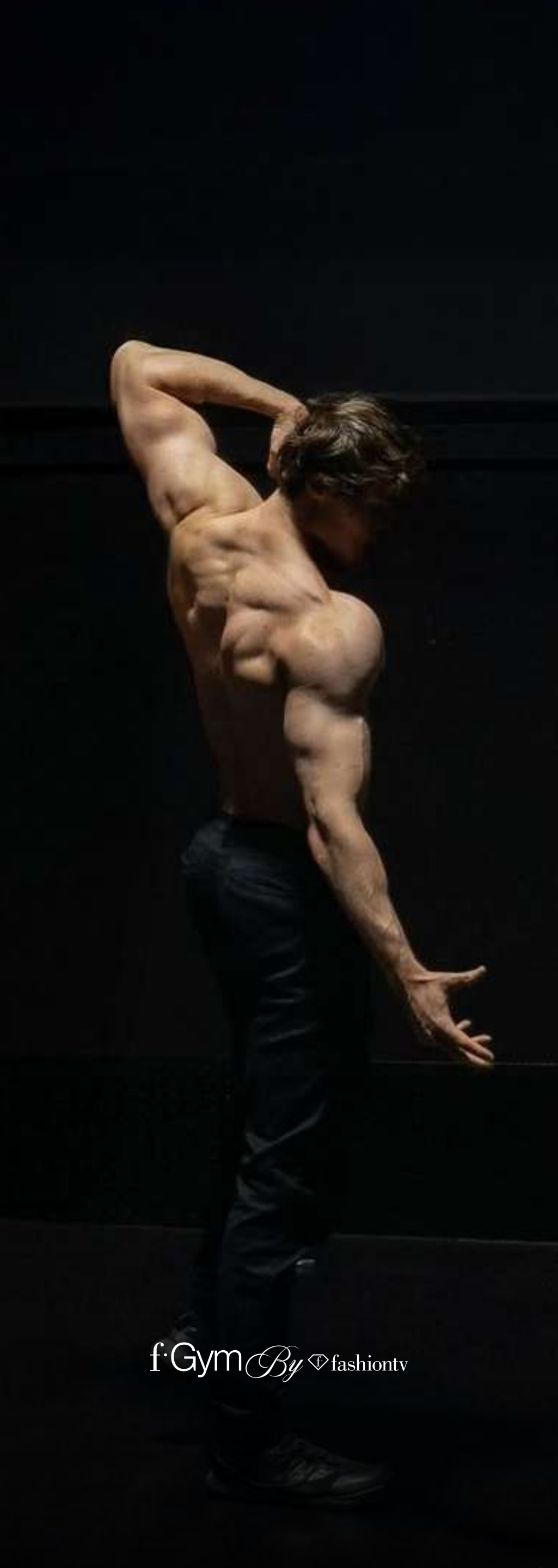
f:Gym By fashiontv