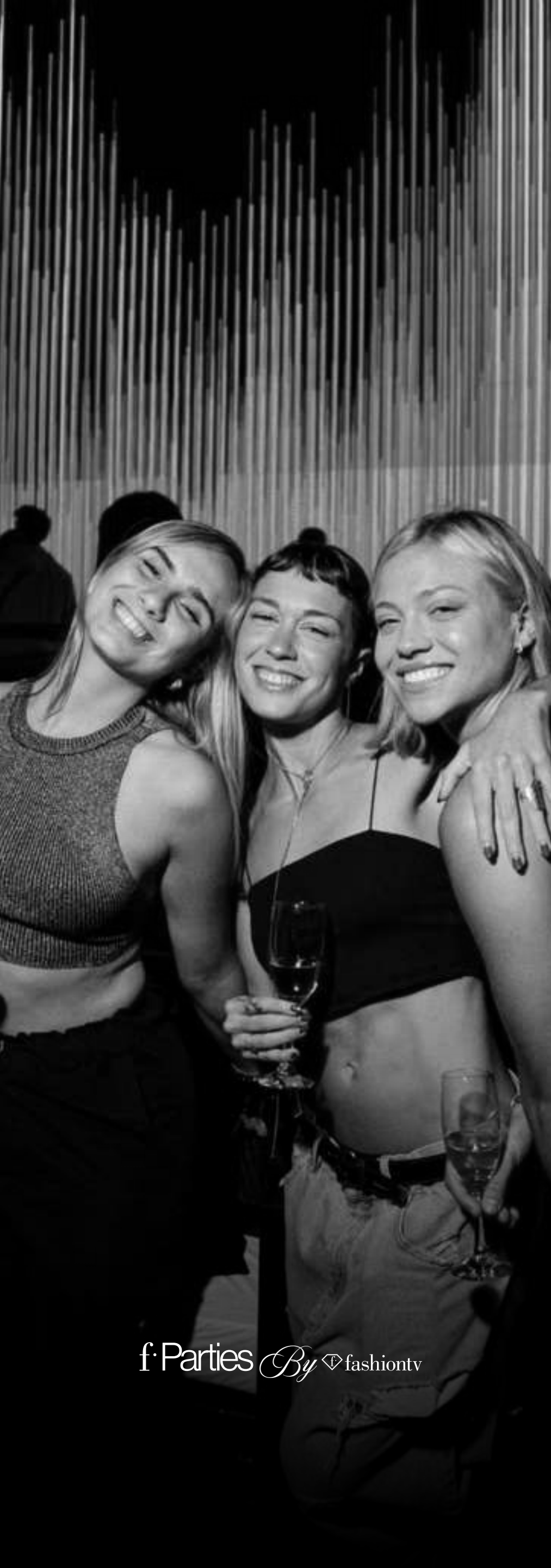
f: Parties By fashiontv