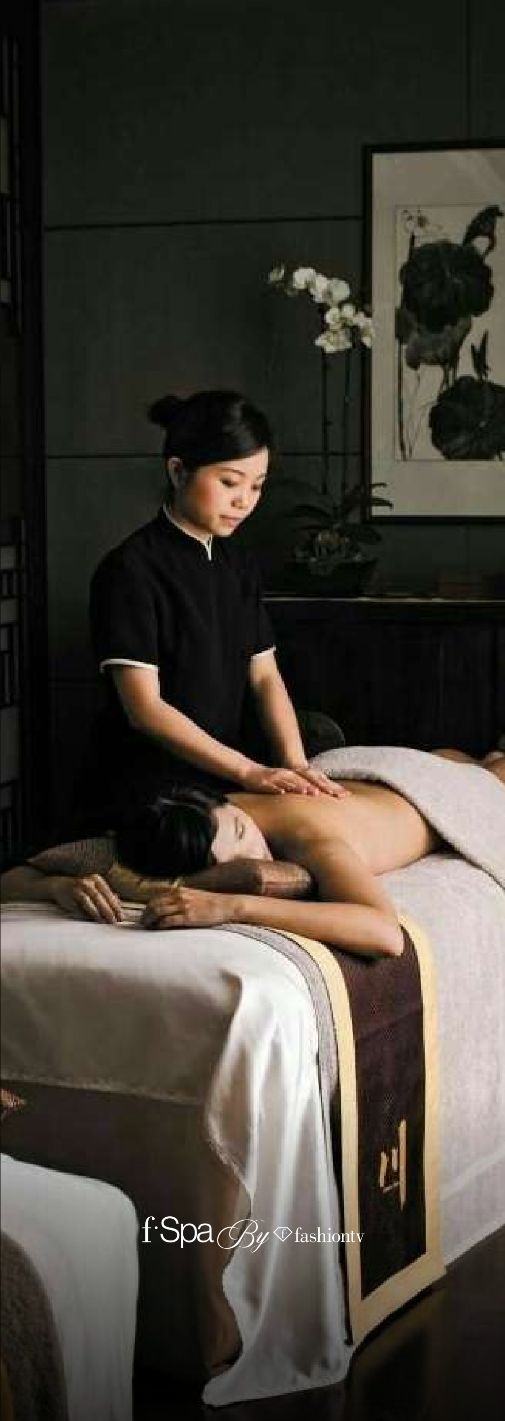
f:Spa By fashiontv