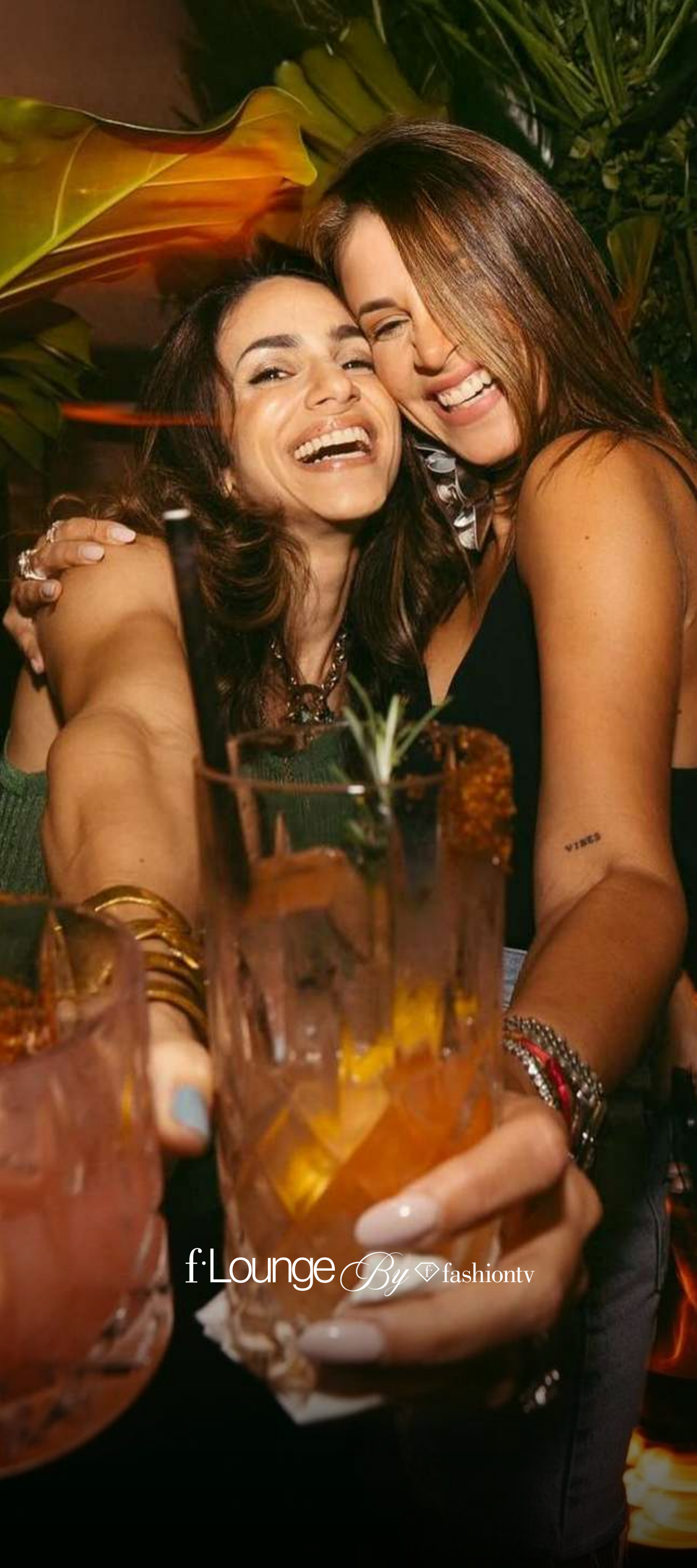
f:Lounge By fashiontv