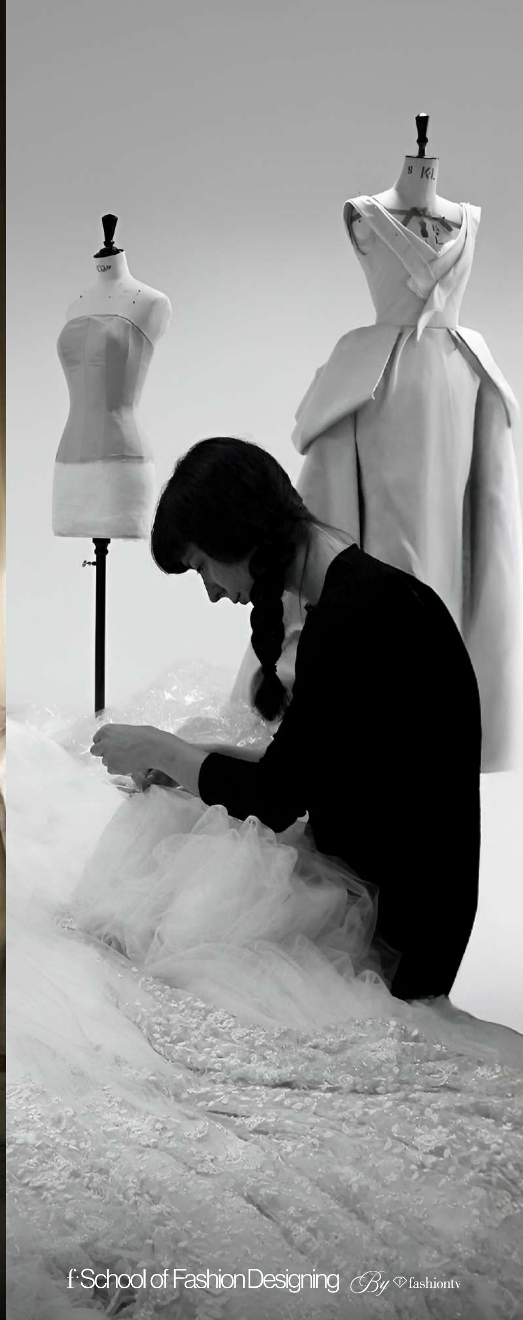
f School of Fashion Designing By fashiontv