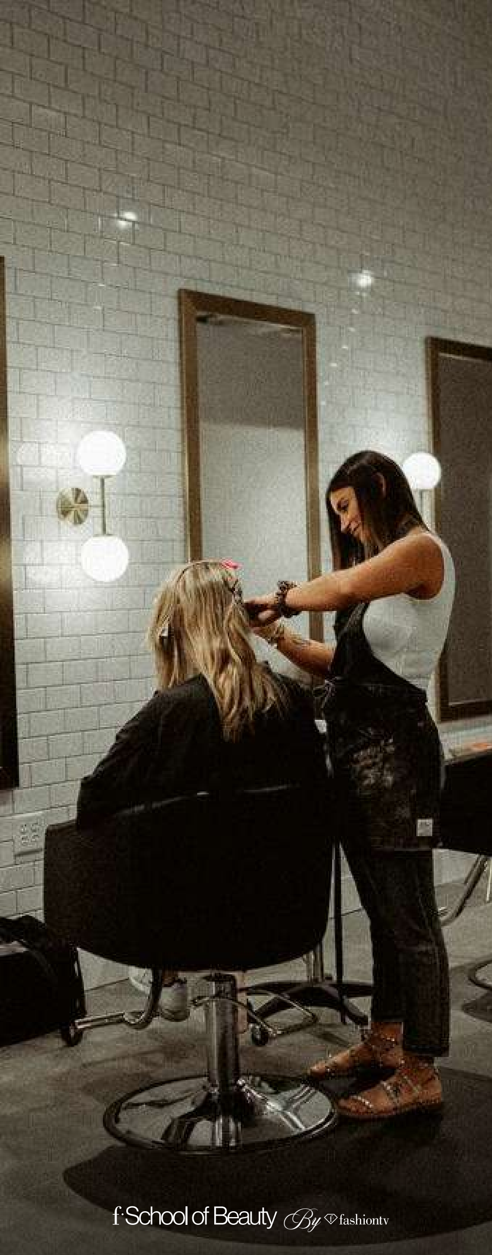
f School of Beauty By fashiontv