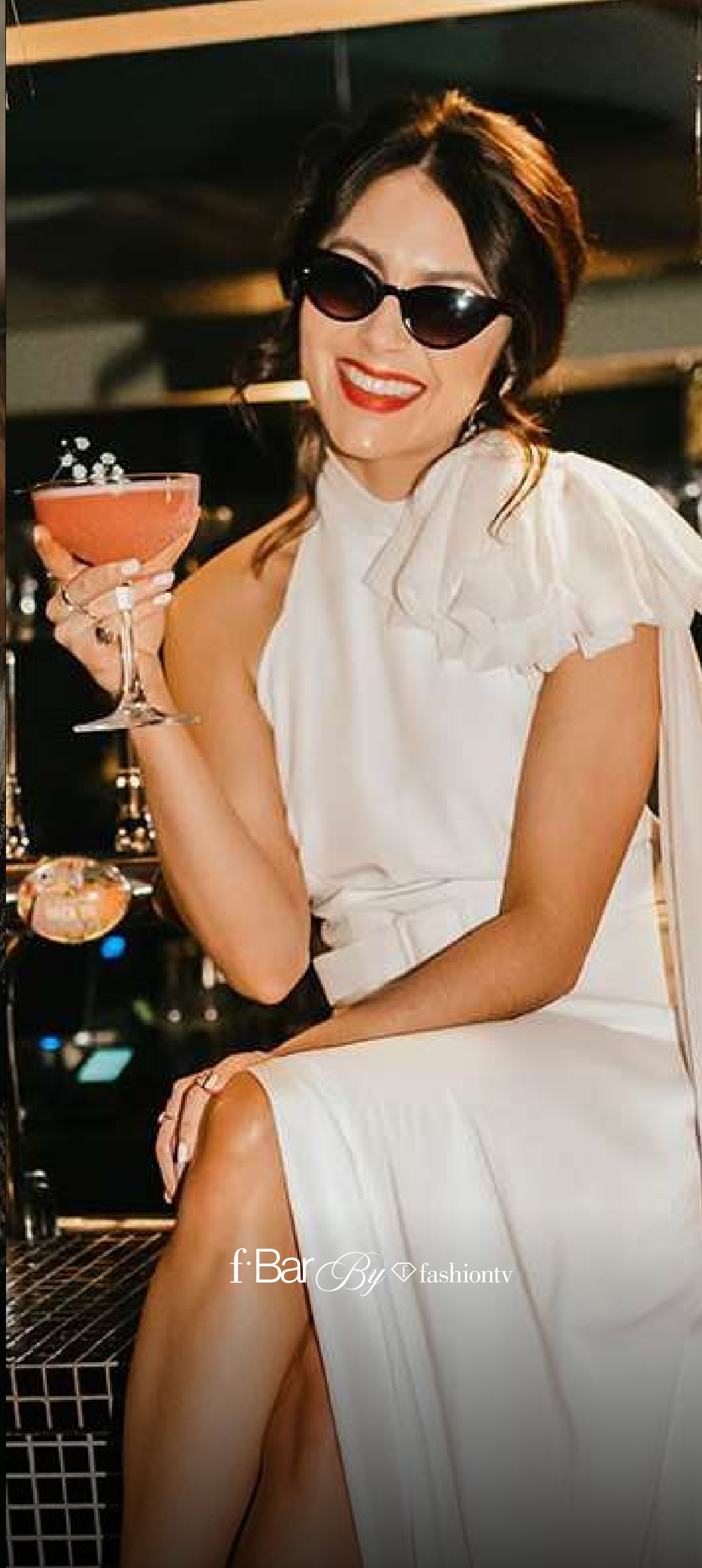
f:Bar By fashiontv