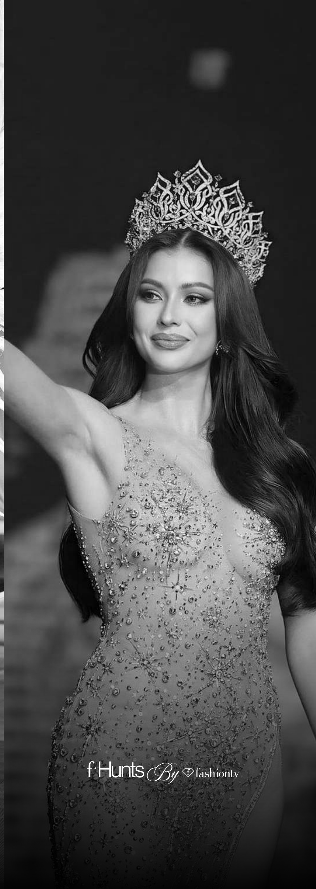
f: Hunts By fashiontv