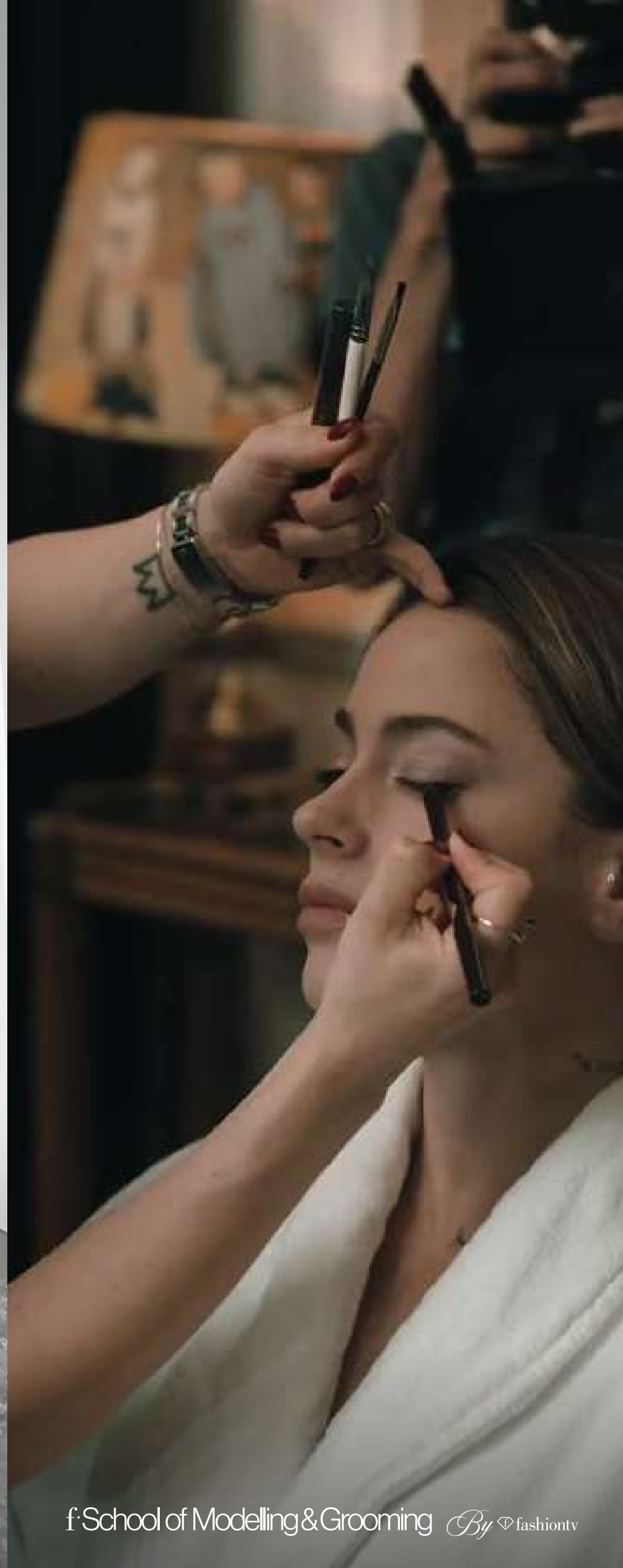
f School of Modelling & Grooming By fashiontv